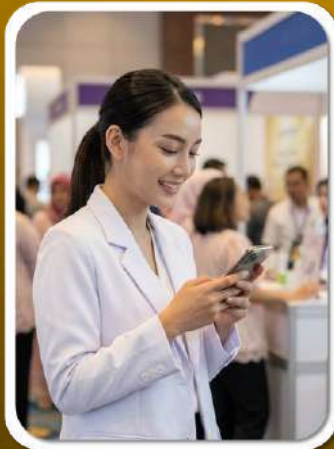
POIN KUNJUNGAN BOOTH