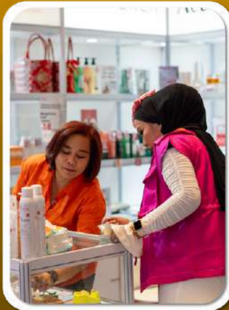
EXHIBITION FLASH SALE